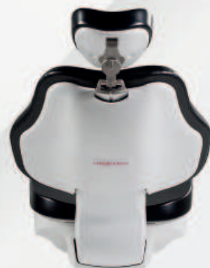
XL MEMORY FOAM BACKREST