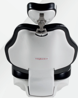
XL MEMORY FOAM BACKREST